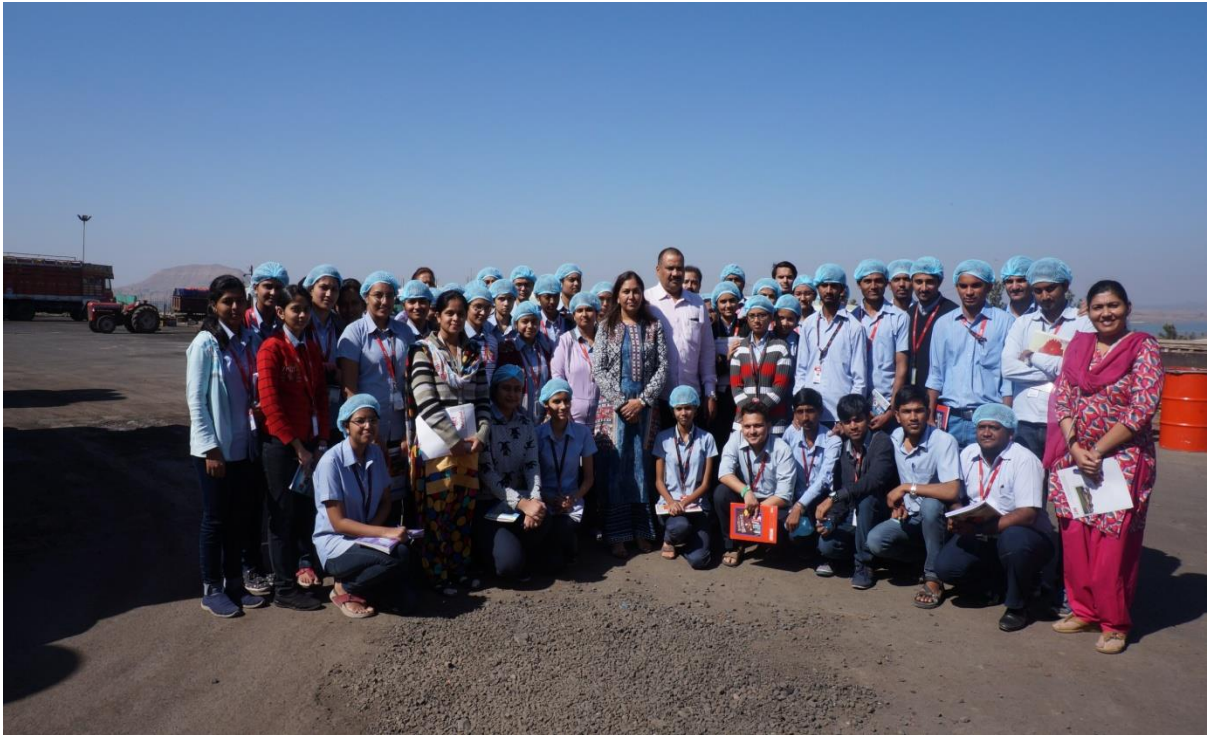
ED Cell Students, faculty members along with Managing Directors of Varun Agro Ltd.