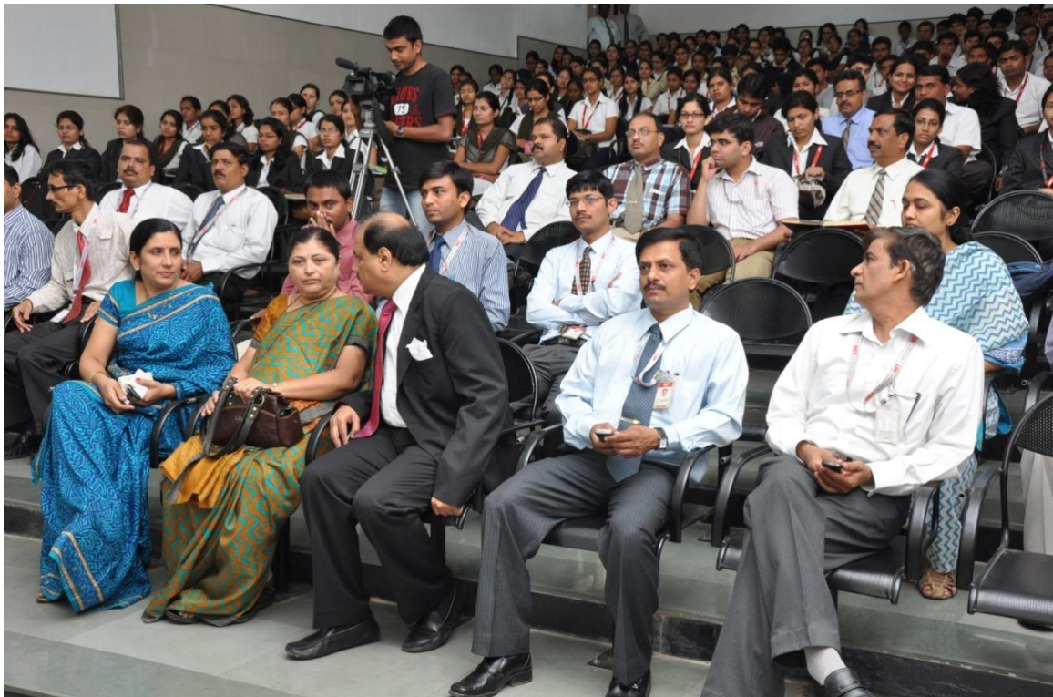
Audience at Inaugural Function