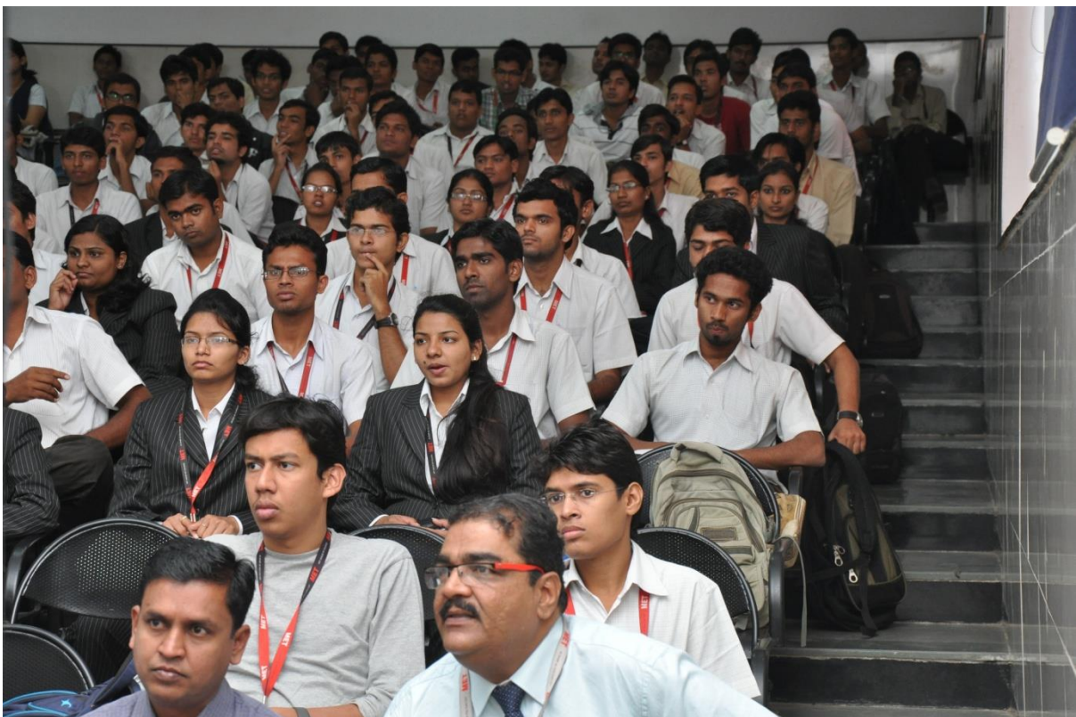
Faculty members and student participants